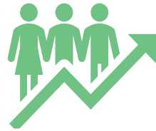
Economic Adjustment Assistance (EAA)