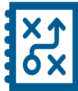
Trade Adjustment Assistance for Firms