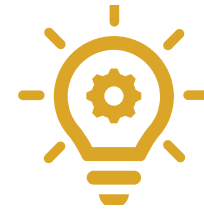
Innovation and Entrepreneurship