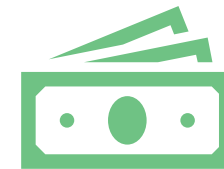
Revolving Loan Funds (RLF) Part of EAA