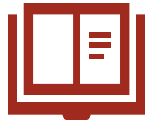
Research and Evaluation