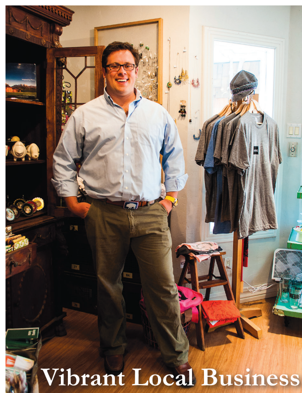
Vibrant Local Business