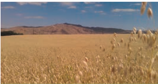
Oat field in Powell.

Cheyenne DDA will be asking property owners to double their current property tax allocation to support organization efforts in an election this fall.