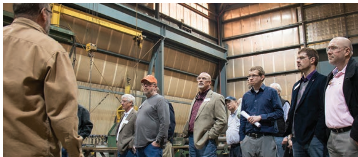
Wyoming Business Council Board of Directors members and staff listen intently during a tour of High Country Fabrication a day before the March 12 board meeting in Casper.

The majority of new jobs created will come from businesses already located within the community, so it is important to address the needs of these existing businesses. The Business Council contracts with the Business Resource Network to provide assistance targeted to existing business expansion. The Council provides a variety of business retention and expansion assistance including, but not limited to, business