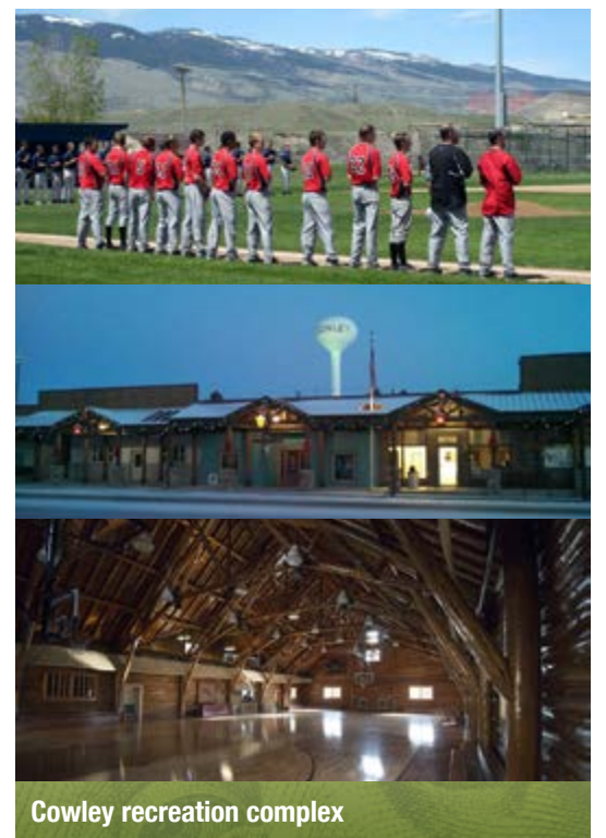
Cowley recreation complex

The Evanston Cultural Center in the Strand Theater completed its renovation this summer. The theater was built in 1917 and was severely damaged by fire in 2007. The Evanston Urban Renewal Agency and Sagebrush Theatre Production received an Our Town grant from the National Endowment for the Arts to create a cultural hub for the community. The project also received Wyoming Business Council grant funding.