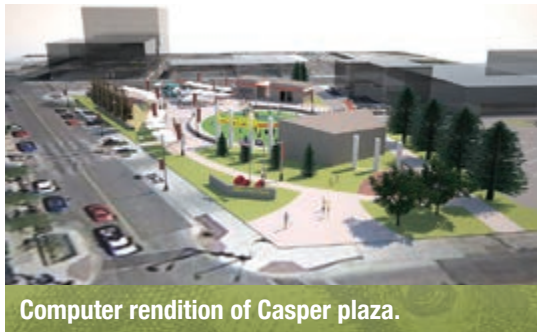
Computer rendition of Casper plaza.

In 2010, the city of Powell received $450,000, and in September 2011, the city of Powell received an additional $267,795 in Business Committed grant funds for a total of $717,795, for the construction of a 2,880 square foot concrete building that facilitated the expansion of Gluten Free Oats. The building allows Gluten Free Oats to complete the cleaning, rolling and packaging processes in Powell.